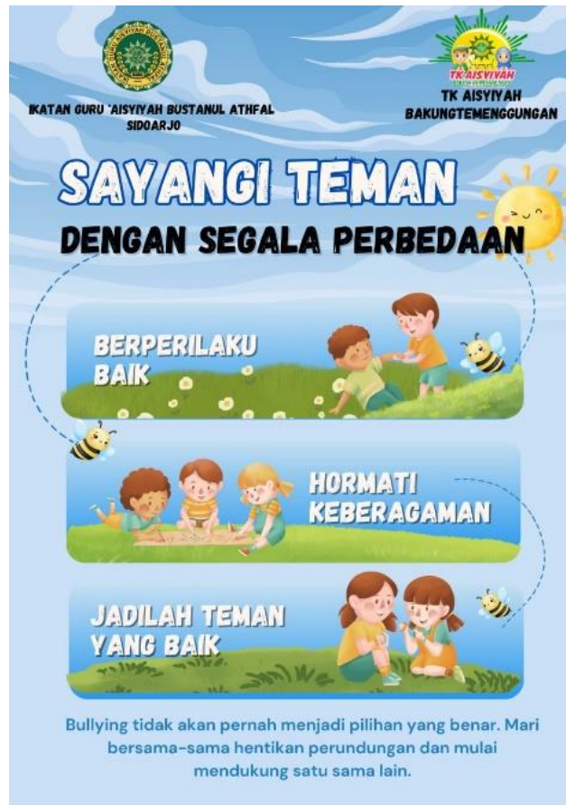
Figure 8. Poster Theme "Encouragement to Appreciate All Differences".