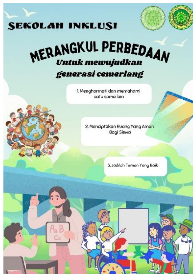
Figure 5. Poster Theme "Encouragement to Appreciate All Differences".

In this training and mentoring, various poster creations by IGABA Sidoarjo teachers using Canva were produced. The Canva media helps teachers create attractive posters in a short time and is easy to apply. The researchers evaluated several poster works by IGABA Sidoarjo teachers by referring to the following poster assessment aspects.