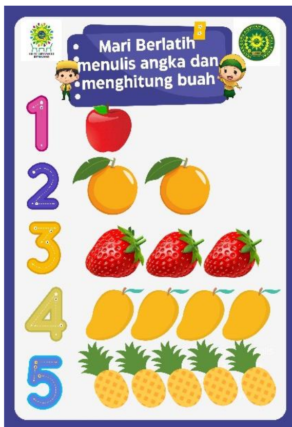
Figure 6. Poster Theme "Let's Count".