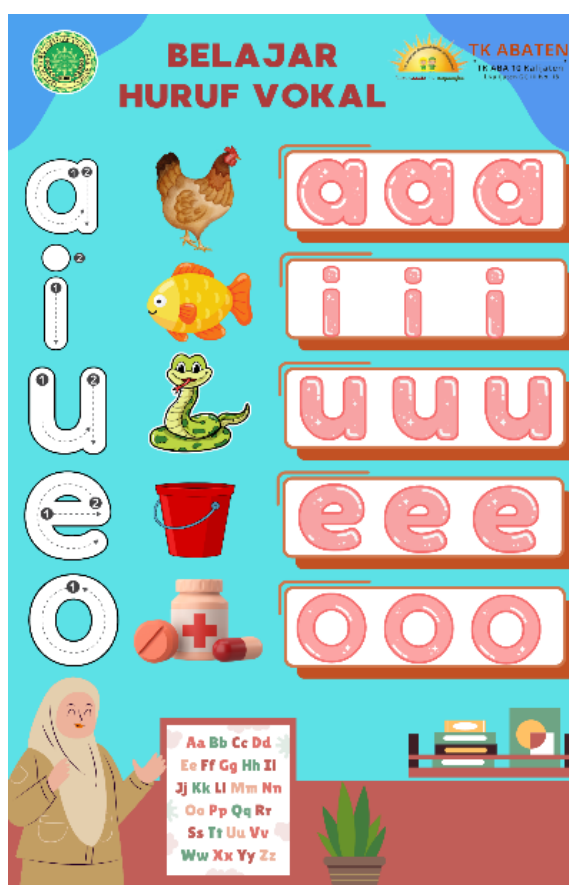
Figure 7. Poster Theme "Introducing Vowels".