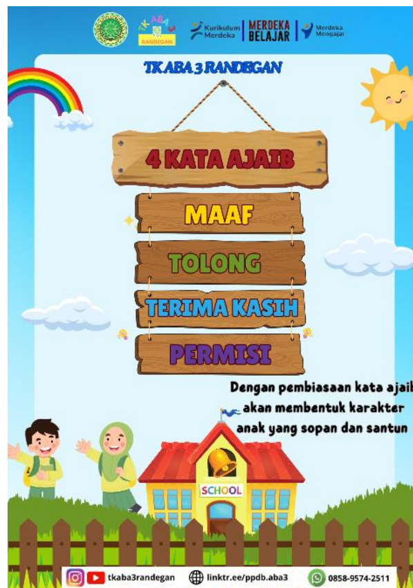
Figure 9. Theme Poster "4 magic words".