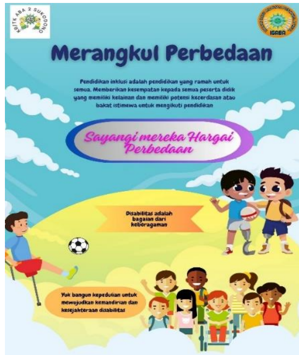
Figure 3. The poster results from one of the training participants.