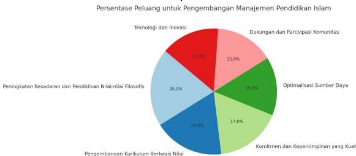
Diagram 1. Presentation of Opportunities for Islamic Education Management Development

Identifying opportunities that can be exploited for the development of more effective Islamic education management based on philosophical values [54];[17]. Increased awareness and education of philosophy values, development of value-based curricula, strong commitment and leadership, optimization of resources, support and participation of communities, and the utilization of technology and innovation is several opportunities which can be taken for achieving these goals [53]. With the exploitation of these opportunities, educational institutions can create an environment that is focused not only on academic achievement but also on strong character and moral development [55]; [21]